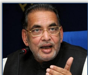
Hon'ble Union Minister Shri Radha Mohan Singh

NCCD was honoured to feature the following luminaries in 2014 editions of this newsletter.