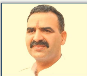
Hon'ble Minister of State Shri Sanjeev Kumar Baliyan

Transport is lifeline for farmers; ease the bottlenecks in food movement